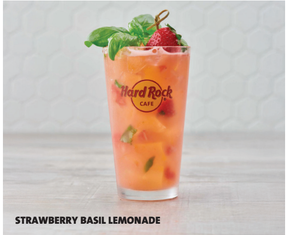
STRAWBERRY BASIL LEMONADE