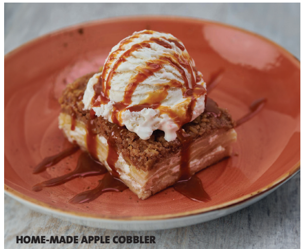
HOME-MADE APPLE COBBLER

Choose from vanilla bean or rich chocolate. $8.95 (660 cal)