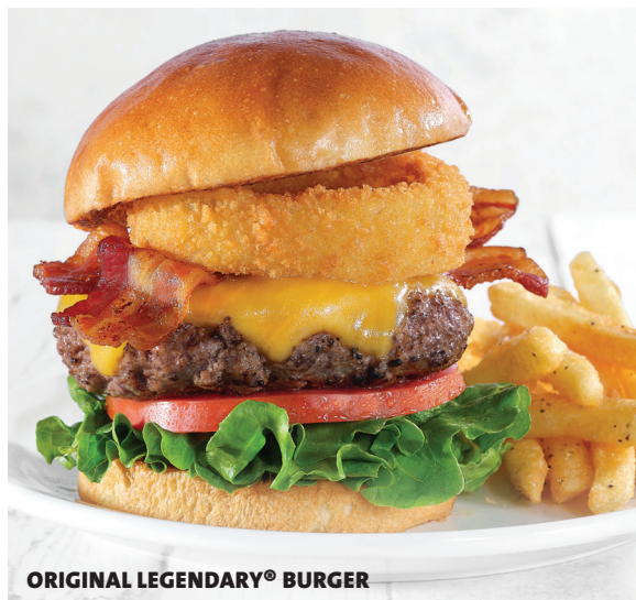
ORIGINAL LEGENDARY® BURGER

Fresh steak burger, with applewood bacon, cheddar cheese, crispy onion ring, leaf lettuce and vine-ripened tomato.* $23.95 (1720 cal)