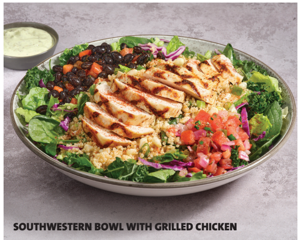
SOUTHWESTERN BOWL WITH GRILLED CHICKEN