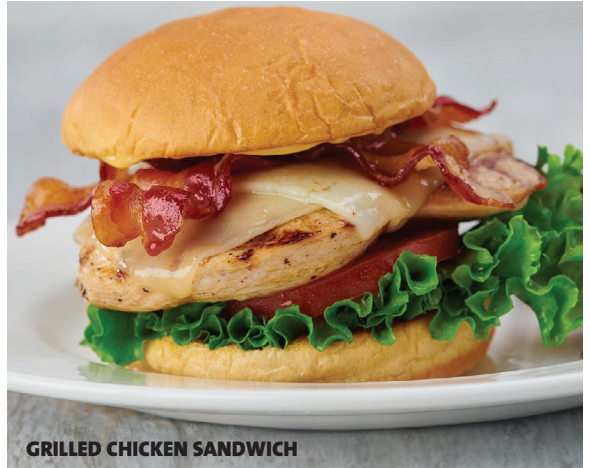
GRILLED CHICKEN SANDWICH