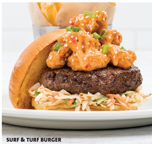
SURF & TURF BURGER

Two smashed & stacked burgers seasoned and seared to medium-well, with pepper jack cheese, pickled jalapeños, leaf lettuce, vine-ripened tomato and spicy mayonnaise.* $20.95 (1425 cal)