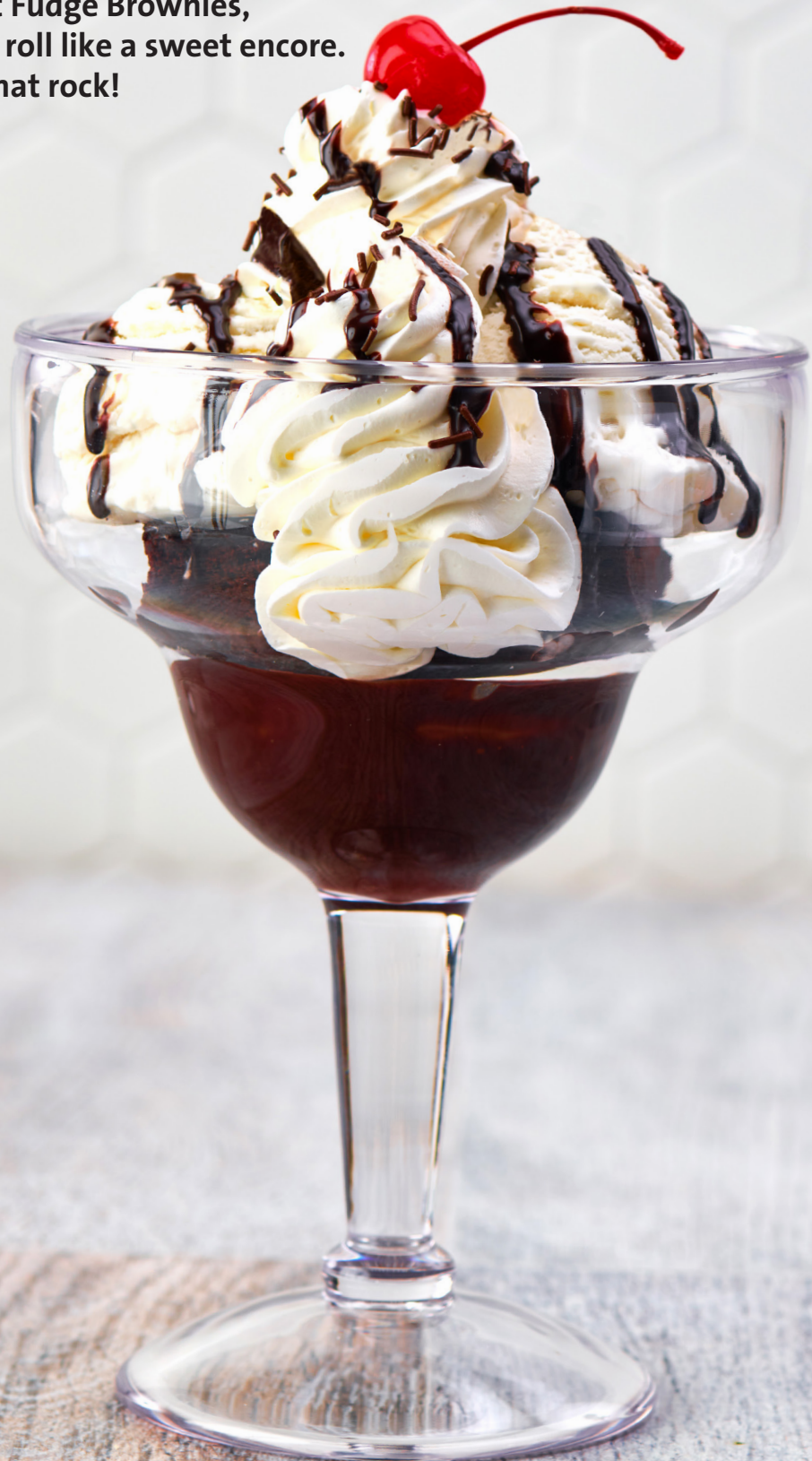
HOT FUDGE BROWNIE

From Cobbler to Hot Fudge Brownies, nothing says rock n' roll like a sweet encore. Cheers to desserts that rock!